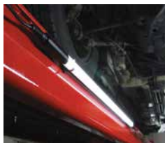
FA5700 Includes 60W power supply unit, 16' cable lengths and 8 magnetic suspensions • 120V AC input voltage • 60hz

Effective runway lighting system, attach the four 54" light wands to runways for efficient lighting where you need it.