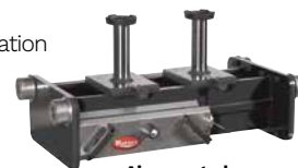
Air operated rolling bridge jacks