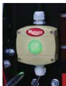
FA834-KIT 110V FA835-KIT 220V