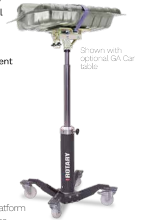
Shown with optional GA Car table